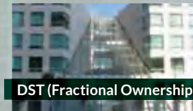
DST (Fractional Ownership)