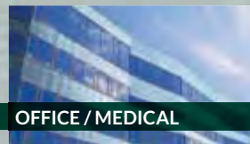
OFFICE / MEDICAL

To qualify as a “like-kind” property for a §1031 exchange the investor's relinquished property and replacement properties must be property that has been and will be held for productive use in the investor's trade or business or for investment.