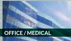
OFFICE / MEDICAL

To qualify as a “like-kind” property for a §1031 exchange the investor's relinquished property and replacement properties must be property that has been and will be held for productive use in the investor's trade or business or for investment.